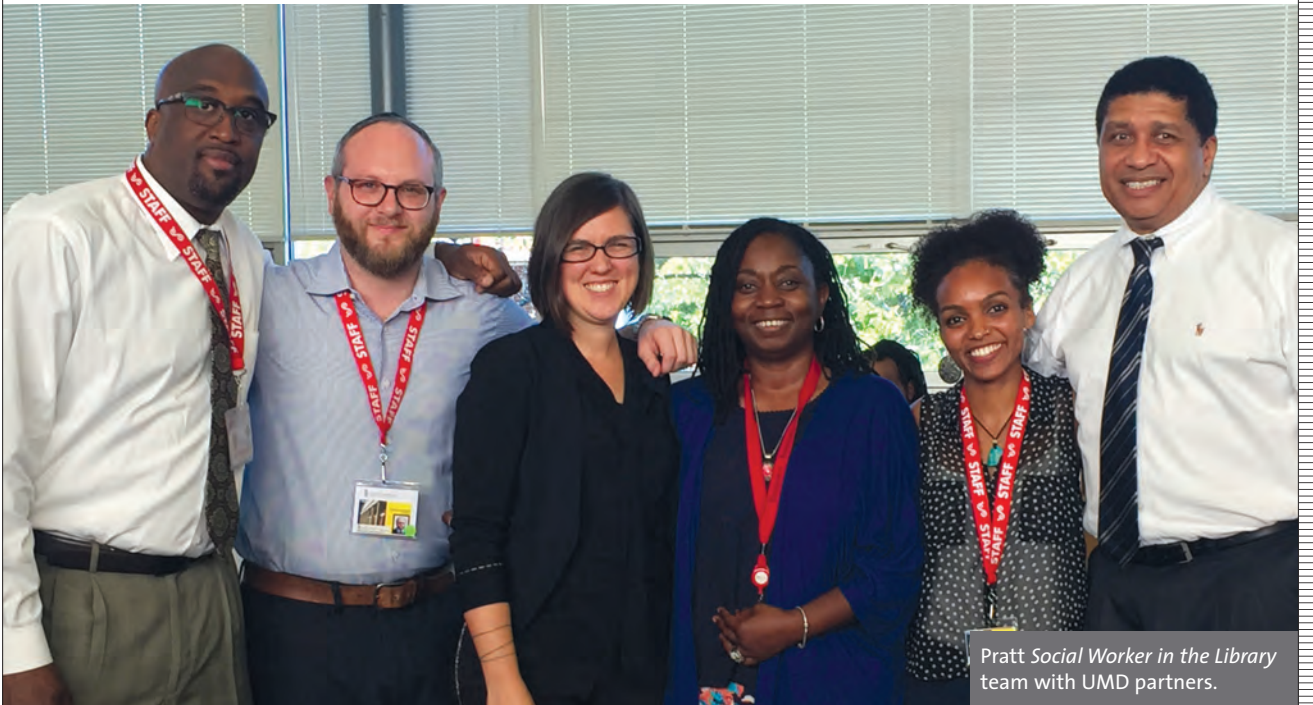
Pratt Social Worker in the Library team with UMD partners.