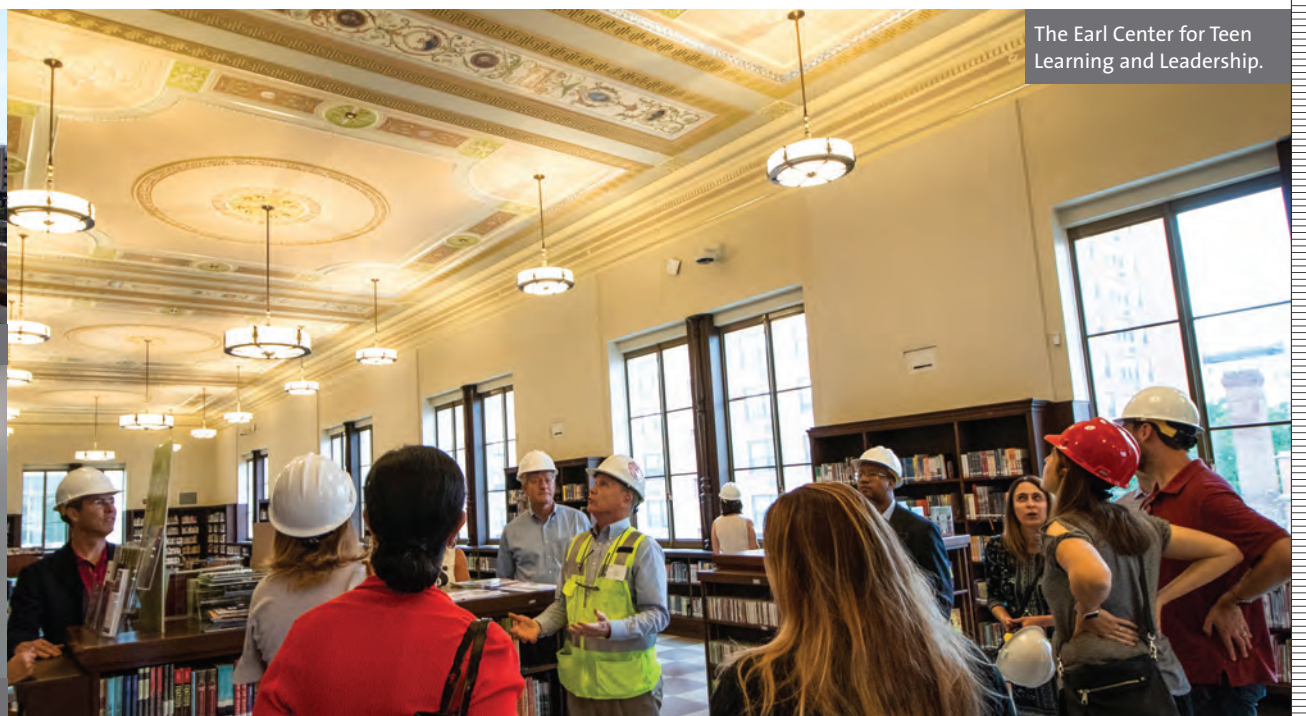
The Earl Center for Teen Learning and Leadership.