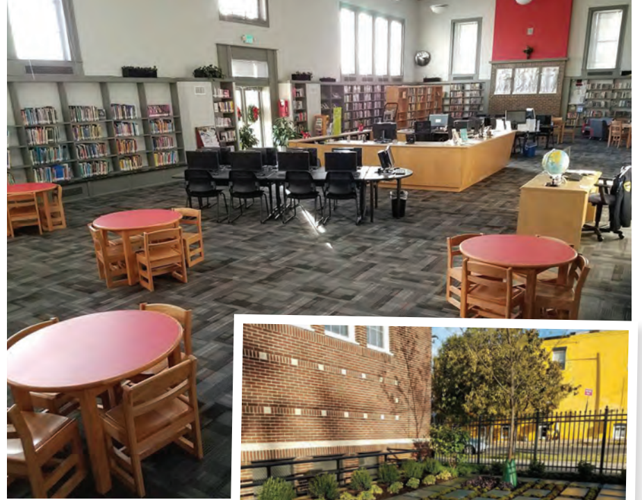
The Patterson Park library’s renovated interior and exterior garden.

The Pratt is thankful to the entire community of donors who have already chosen to support this important initiative. In particular, The Harry and Jeanette Weinberg Foundation has committed significant funding to support upgrades to technology, equipment, and renovations to children’s areas in