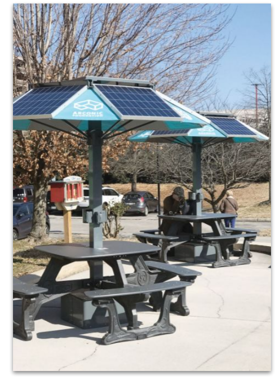
Blount County, TN